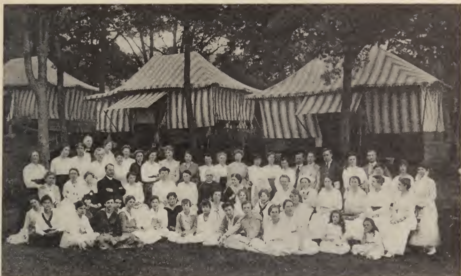
1917 CHURCH DELEGATION, LAKE GENEVA CONFERENCE